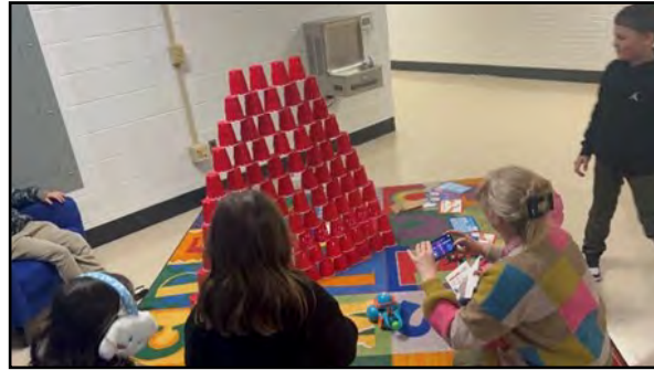
Library staff participate in STREAM Night at Butz Elementary School.