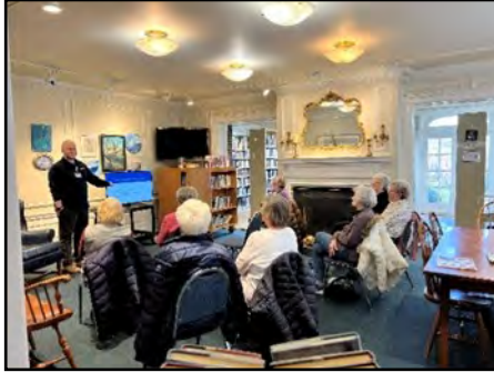
Library patrons participate in the audiobook workshop a part of our Thriving Thursday programs presented by St. Luke's University Health

As the days grow longer and warmer, the Memorial Library of Nazareth & Vicinity is welcoming spring with a variety of programs designed to bring the community together through learning, creativity, and fun for all ages. From family photo opportunities to beloved annual traditions, there is something for everyone this season.